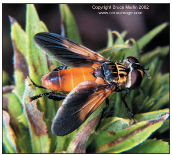
Tachinid fly (Trichopoda pennipes).

Biological control was part of the Iowa State Study. Buckwheat was interplanted to attract the tachinid fly parasitoid, Trichopoda pennipes, of A. tristis. T. pennipes deposits eggs on large nymph and adult squash bugs. After hatching, tachinid fly larvae feed on the squash bug, eventually killing it. Unfortunately, the victim may continue to feed and lay eggs for a while after it has been parasitized. Therefore, even parasitism levels as high as 80 percent may not prevent measurable economic damage. (26) The Iowa State study found that planting a buckwheat intercrop to enhance tachinid fly parasitism consistently outperformed applications of kaolin clay in reducing squash bug infestations. However, squash yields in the buckwheat intercrop plots were reduced by a factor of at least six at Abbe Hills Farm and a factor of three at Pratt Farm, when compared with the row-cover trial plots.