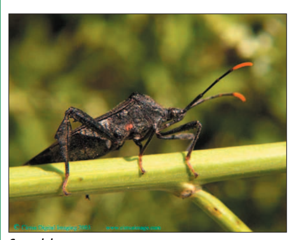
Squash bug.